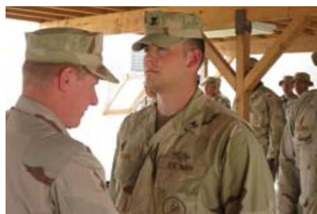
CE2 Gannon Seabee Combat Warfare pin