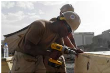
At work in the Alpha yard