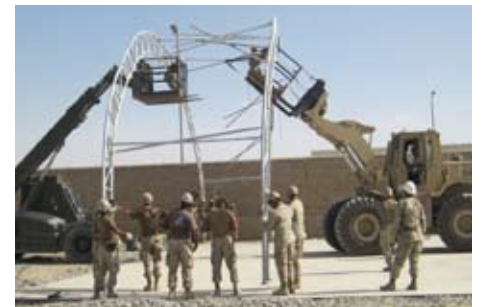
Constructing tension fabric structures