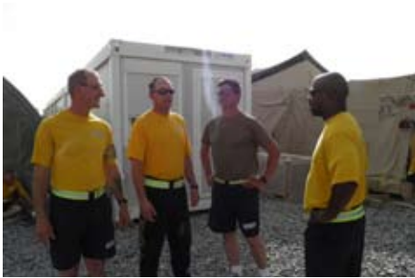
"That scale was way off!"