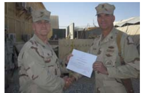
CMDMC Cassidy Letter of Appreciation 2010 Active Duty Fund Drive