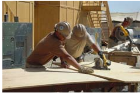
Bigger and better offices, thanks to our Builders!