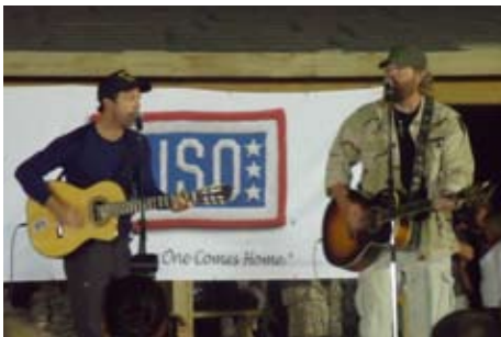
Toby Keith performed for troops at KAF.