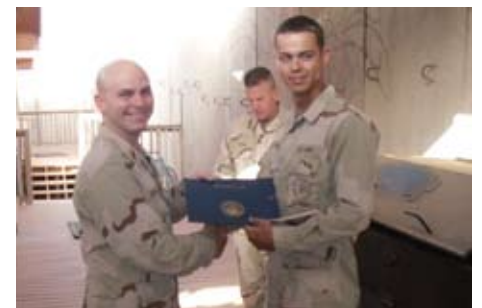
BUCN Hicks Bluejacket of the Month Det Whiskey Iraq