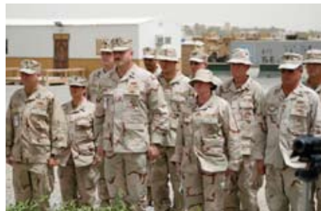
Seabees at attention during the Memorial Day speech