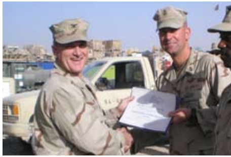
HMC Fortier Seabee Combat Warfare pin