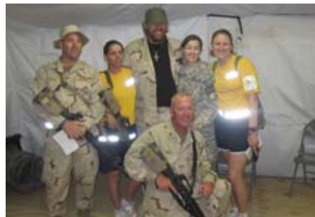
A few Seabees became Groupies for a night