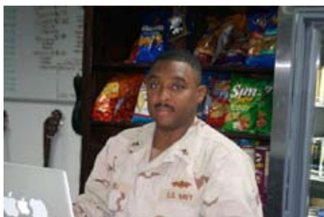
May I help you??