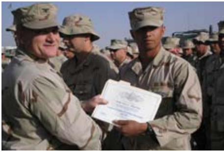
BUCN Krawczyk Seabee Combat Warfare pin