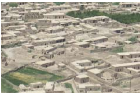
Flying over an Afghan village