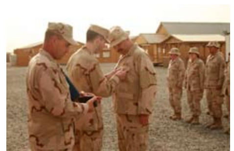
CM1 Moats Navy and Marine Corps Achievement Medal