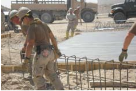
Pouring concrete at Mustang ramp