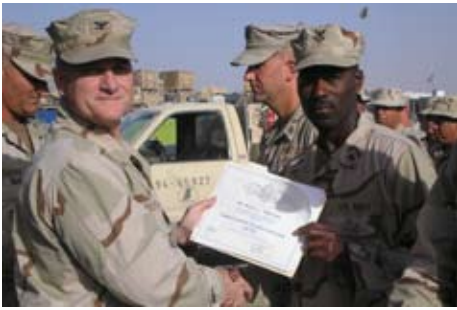
MR1 Robinson Seabee Combat Warfare pin