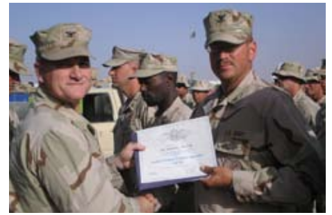
BU2 English Seabee Combat Warfare pin