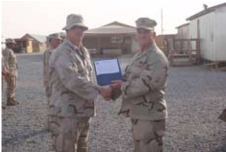
CM1 White Sailor of the Month Kuwait