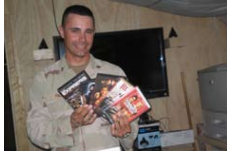
Thank you for the care packages!