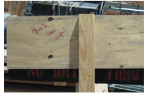
You might be a redneck...