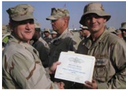
CMCN Magjuni Seabee Combat Warfare pin