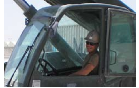
Frankie says "Relax!"