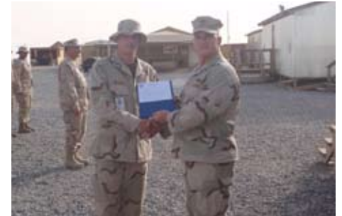
BUCN Melioris Bluejacket of the Month Kuwait