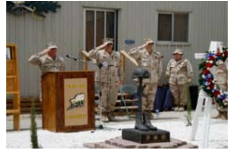
Memorial Day ceremony in Kuwait