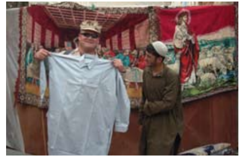
Do I look fat in this?