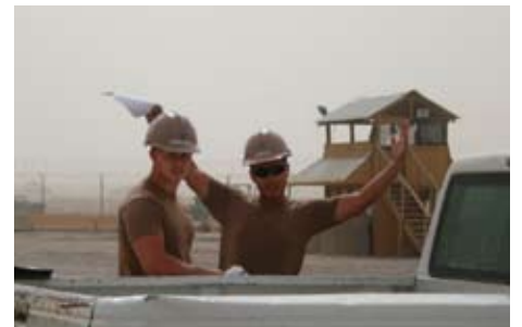
Get back to work