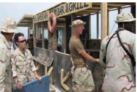
Seabees get a taste of life at Sea