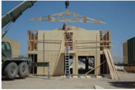
SWA hut construction at KAF Mustang ramp